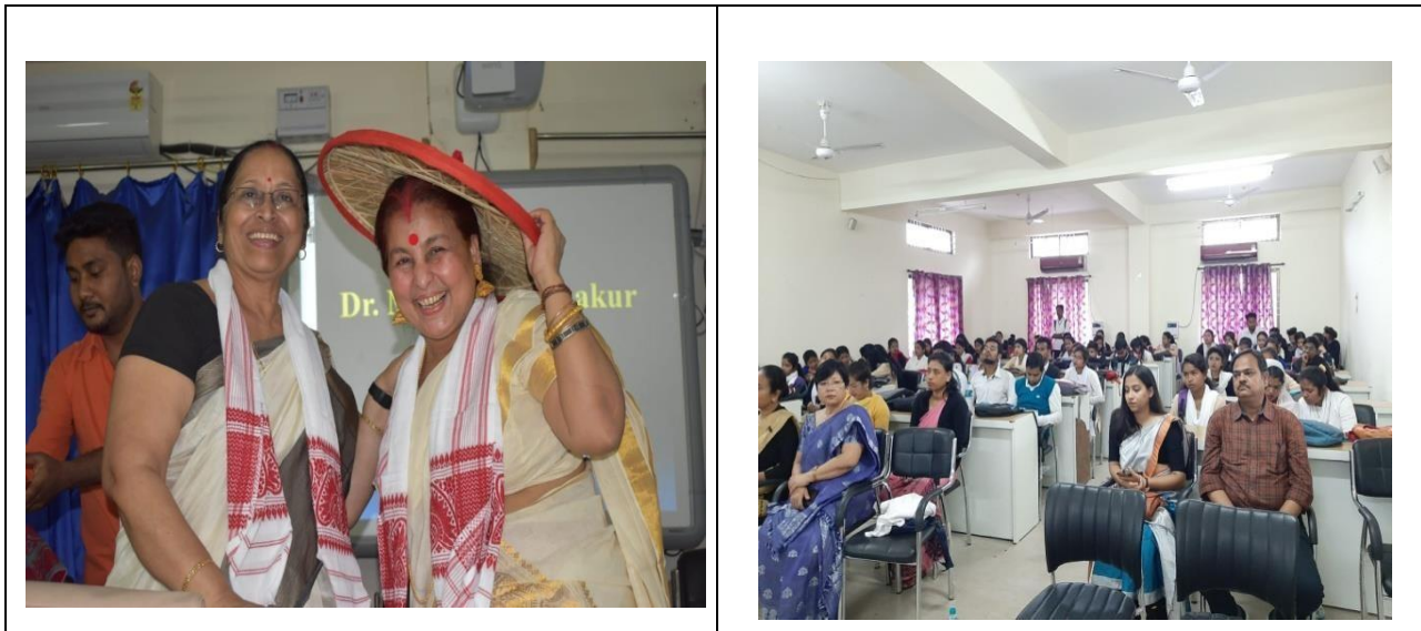
Pre-Marital Counseling Class

Some Captured moments during the Seminar are shown below